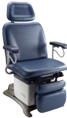
Ritter 230 Universal Power Procedures Table (shown with optional adjustable arm system)